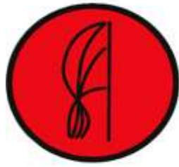
SS Start Point