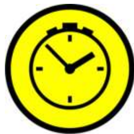
CP Area Enter

The time Control Points (CP) are defined with the following signage.