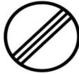
SS Start Area End