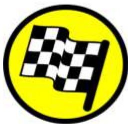
100 m to FF line

Competitors will be given a time for the next liaison on Stop points.